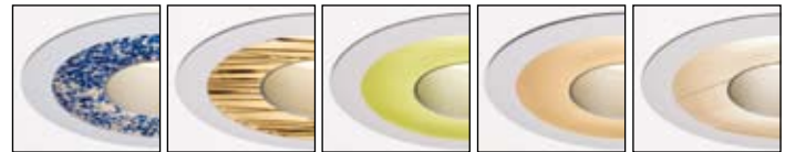
#2 - Blue Crush #3 - Tiger Thatch #4 - Linea Vert #5 - Bronze Weave #5 - Fossil Leaf Custom material available. Consult factory.