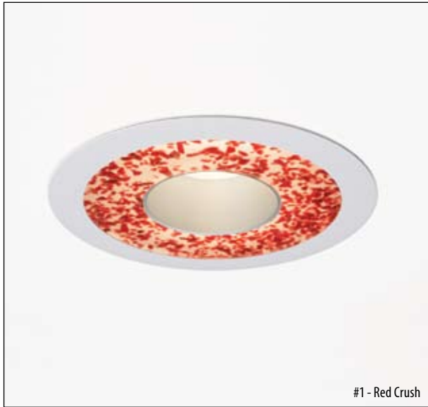
#1 - Red Crush

6" Horizontal Compact Fluorescent With Decorative Eco Resin Flush Mount