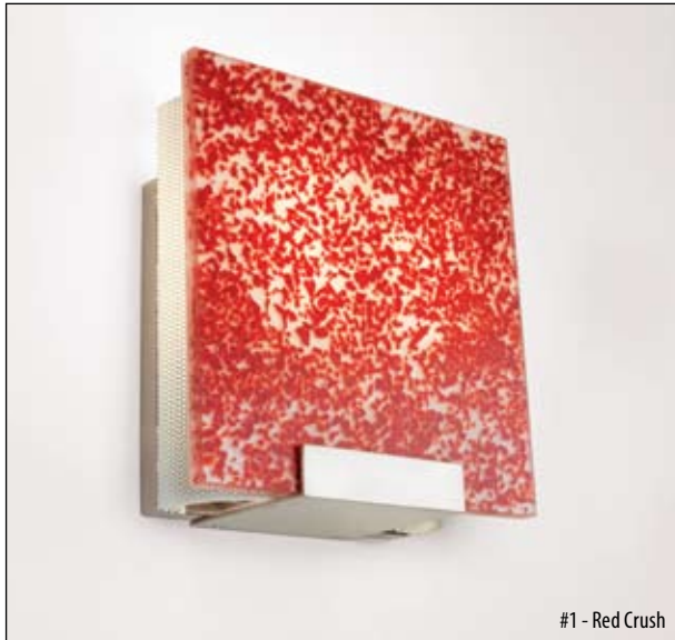
#1 - Red Crush