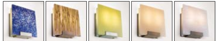
#2 - Blue Crush #3 - Tiger Thatch #4 - Linea Vert #5 - Bronze Weave #6 - Fossil Leaf Custom material available. Consult factory.