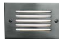
-AG: Angle Louver