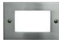
-OP: Open Face