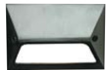
-HM: Half Moon